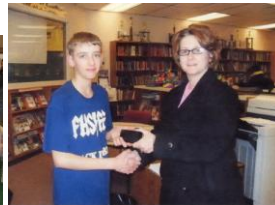
** Ipod Winner**