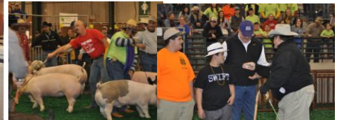
LSU Spring Show

Thank you Honor's Feed for your donation!