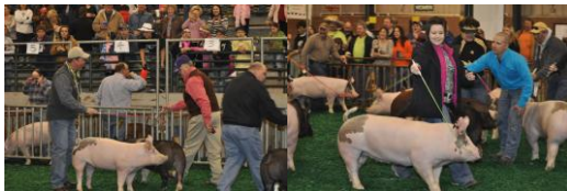
Adult swine Showmanship